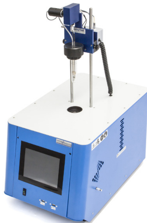
NewLab 410 ST